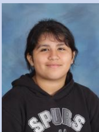
8th Grade Abraham Kazan Middle School, South San Antonio ISD, Texas