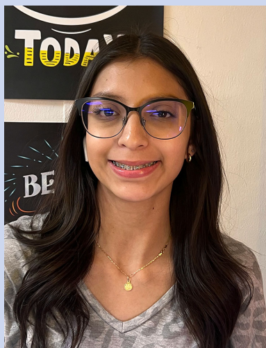
10th Grade Odessa High School Ector County ISD, Texas