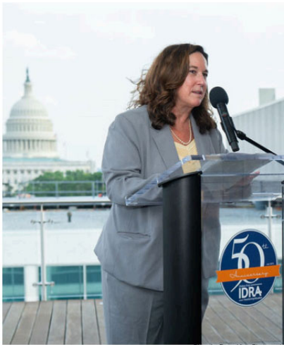
U.S. Department of Education Deputy Secretary Cynthia "Cindy" Marten